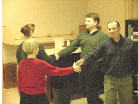
Half Rights and Lefts

Half Rights and Lefts. Two facing couples give right hands to partner and cross the set, turn to face neighbor, and then give left hands to neighbor. Pass neighbor and turn to face partner across the set.