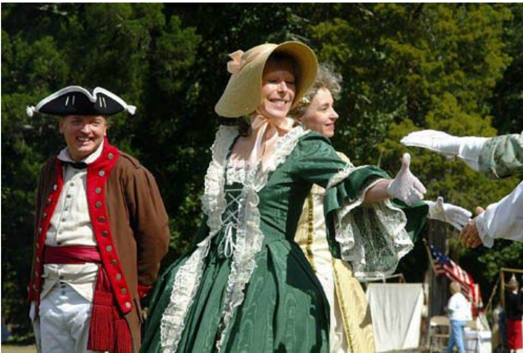
Performance at Eppington Plantation in Chesterfield County, VA

The Colonial Dance Club of Richmond is dedicated to the promotion and preservation of English Country Dancing. Sponsored by the County of Henrico, VA Division of Recreation and Parks, we were established in 1977. Since then, our club has been busy introducing young and old to English Country Dancing, giving demonstrations and performances by request in Central Virginia and as far away as Washington, DC.