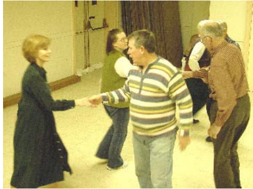
Rights and Lefts

Rights and Lefts. Two facing couples give right hands to partner and cross the set, turn to face neighbor, and then give left hands to neighbor. Pass neighbor and turn to face partner across the set. Repeat until all are where they started the figure.