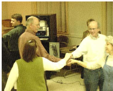
Right Hands Across

Right Hands Across. Four dancers give right hands in a shaking handhold to the person diagonally across the set and move all the way around. Often done for 8 beats and followed by Left Hands Across back.