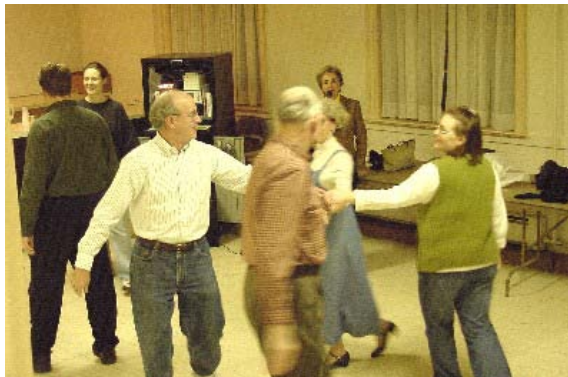
Left Hands Back

Hands Across. Four dancers give right hands in a shaking handhold to the person diagonally across the set and move all the way around, or move halfway around and then give left hands to return to place.