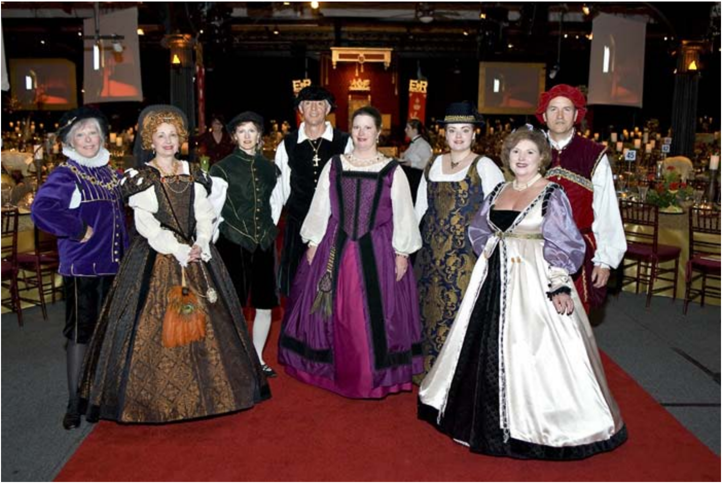
Recent Elizabethan Dance Performance