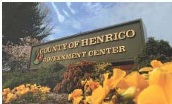
Government Center 4301 East Parham Road 501-4000