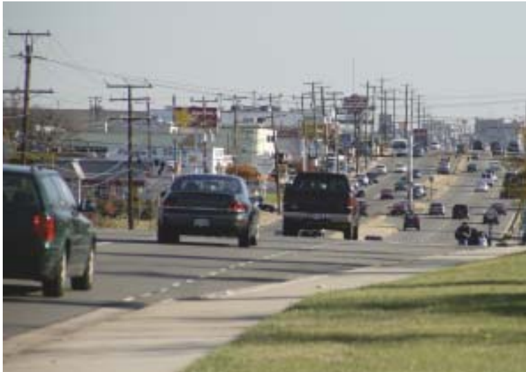
The reorganization of the Planning Office further strengthens the county's ongoing efforts to revitalize Henrico's older neighborhoods and commercial corridors. One beneficiary is this stretch of West Broad Street, which has been included in the Virginia Enterprise Zone Program to boost development along the busy thoroughfare.