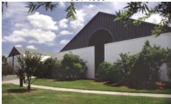
Eastern Government Center 3820 Nine Mile Road 652-3600