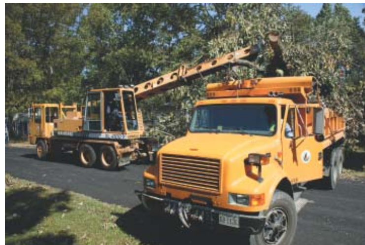
Just after Isabel hit, residents woke to a multitude of crews from Henrico's Public Works and Utilities departments removing debris throughout the county.

Unlike many natural disasters, hurricanes do not often arrive unexpected, affording some time for the people in their path to board windows, ready generators and emergency supplies, or to evacuate. But a few days' advance notice is not sufficient time for an entire community—especially a densely populated suburban county like Henrico—to prepare for the massive damage that follows in a hurricane's wake. Months, even