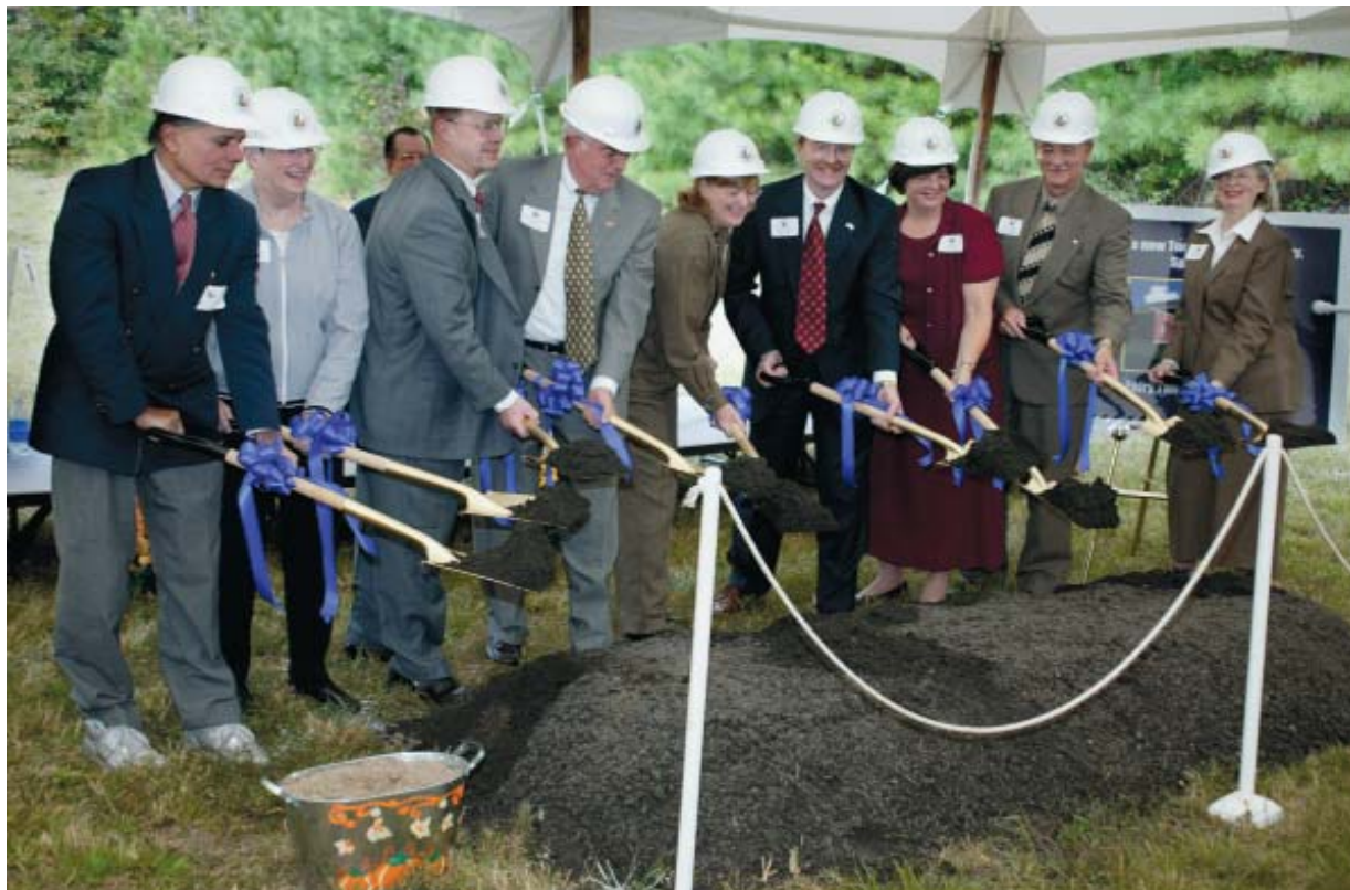
New beginnings: County and library officials break ground on the new and improved Tuckahoe Area Library.

County staff will provide a variety of services, including reviewing contracts and negotiating prices and fair contract terms. Staff also will help residents manage debris-removal activities, ensure that clean-up work on their property is completed and provide general advice and support.