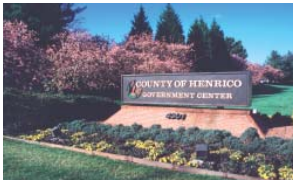
Government Center 4301 East Parham Road 501-4000