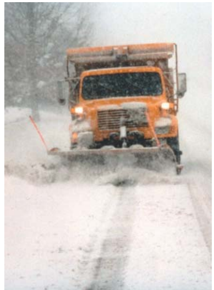
In addition to maintaining county roads, Henrico's Department of Public Works provides snow removal countywide.

For more information, call Public Works at 501-4393 or log on to www.co.henrico.va.us/works and follow the link for “snow removal.”